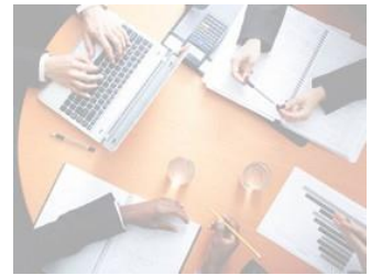
Implementation & Integration