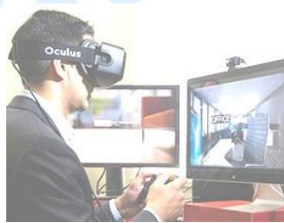
Virtual Reality Solutions